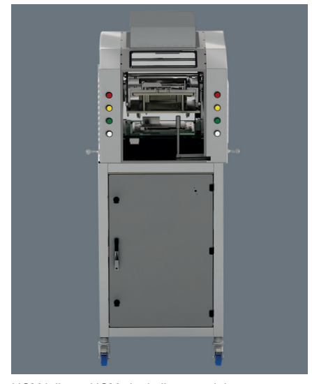
UCM inline – UCM single lines module upgradeable to module line and connectable to robot cells qua standard interface