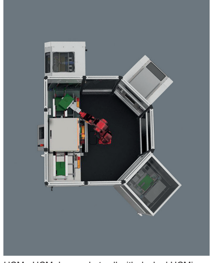
UCMr: UCM demo robot cell with docked UCMi and UCMb for PCB (l. b. & a.) and UCMb for EAS (r. a.) and heating chamber with conveyor (below)